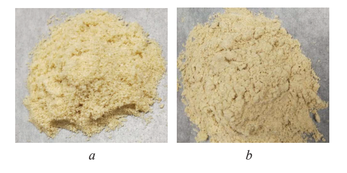
Fig. 1. Derivatives of plant processing: a – sesame flour; b – rice bran

Milk with a fat content of 2.5 % was used to prepare the studied samples. Milk pasteurized at 90–92 °C with holding for 2–3 min and cooled to temperature fermentation 20–22 °C. Fungal leaven was used for leavening in the amount of 2 % to the mass of milk. Part of the milk was used to prepare a suspension of defatted sesame flour ( Fig. 1 , a ), rice bran ( Fig. 1 , b ). For this, the additive was added to the milk in a ratio of 1:10 at a temperature of 90 °C, thoroughly mixed for 10 minutes. The resulting suspension was added to pasteurized milk before fermentation.