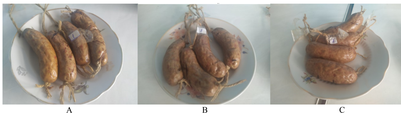
Figure 1 Samples of semi-smoked meat containing sausages with different ratio of duck and fish. Note: Ratio of duck and fish: A – 30:50; B – 40:40; C – 50:30