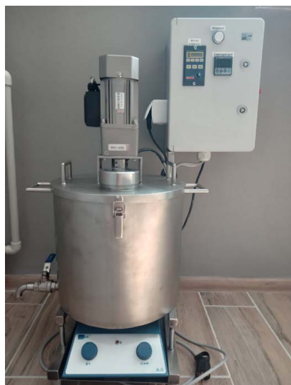
Fig. 1. Laboratory unit for osmotic dehydration

Fruits of Sambucus nigra L. were collected in October 2022 in the Sumy region. Thoroughly washed and dried black elderberries were frozen ( 18 \pm 2 °C). Before processing, they were defrosted and mixed with a 70 % sucrose solution (hydraulic module 1), preheated to 65 \pm 5 °C. Osmotic dehydration of the fruits was carried out for 1 hour in a laboratory unit for osmotic dehydration (Fig. 1).