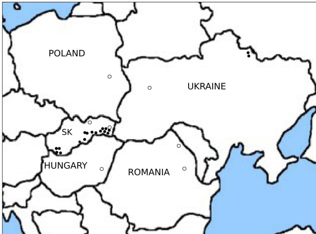
Figure 1. Geographical origin of Echinococcus granulosus sensu lato isolates examined in this study. Full circles indicate pig isolates, empty circles human isolates. SK, abbreviation for Slovakia.

saline (PBS; pH 7.4) and fixed in 70% ethanol for further analyses.