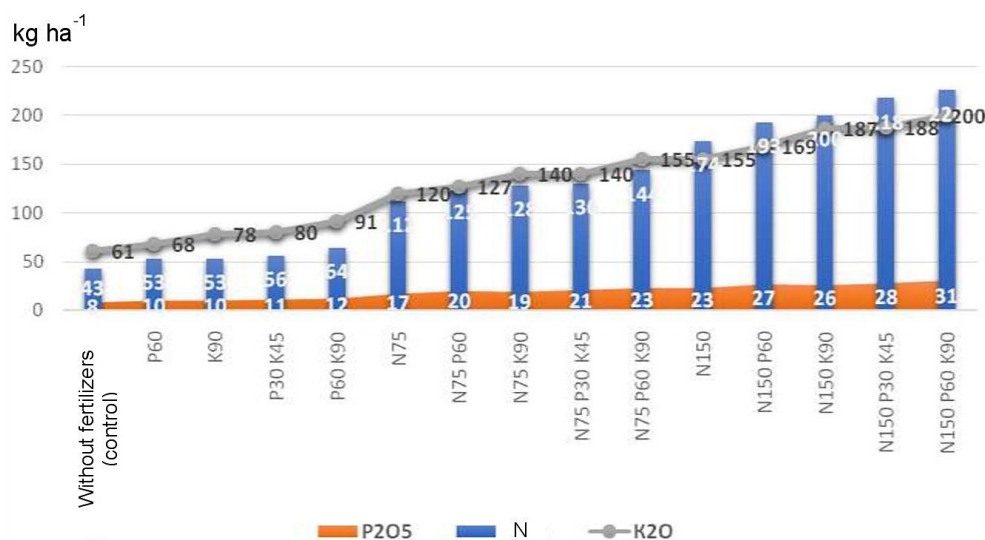
Figure 2. Balance of nitrogen, P 2 O 5 and K 2 O in the system “plant-fertilizer” for growing cereal grasses depending on doses and ratios of NPK fertilizers, average for 2017–2019, kg ha -1

deficiency was found in the variants with combined application of phosphorus and potassium in doses of P 60 K 90 . In the variant with P 60 K 90 , the nitrogen deficit was – 26 kg ha -1 , N 75 P 60 K 90 – 31 kg ha -1 , and N 150 P 60 K 90 – 38 kg ha -1 . With the application of only P 60 , or K 90 , or P 30 K 45 nitrogen deficiency was intermediate between the control and the variant with application of P 60 K 90 .