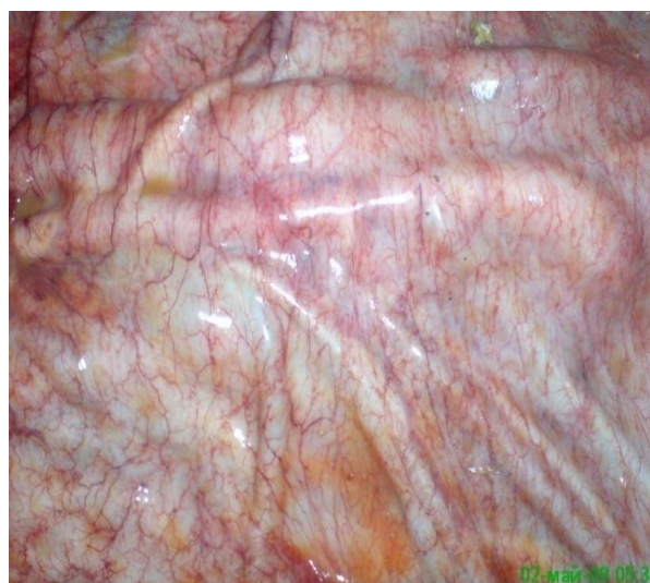
Fig 1. Appearance of placenta of newborn calves, the first subgroups.